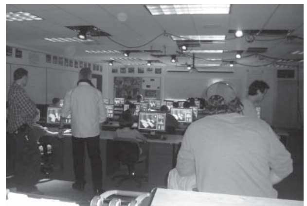
Production crews prepare a classroom at Stebbins for the DP&L commercial shoot.