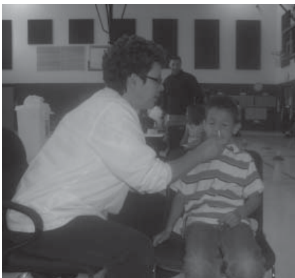
A Brantwood student receives his H1N1 shot during a vaccination clinic this past November.

Over 2000 students received the H1N1 Vaccine in their home schools during the months of November and December. Students ages 10 and up received one dose of the H1N1 vaccine and ages nine and under received two doses, one month apart. Dayton and Montgomery County Public Health provided the vaccine at no charge to all students who provided parental/guardian consent. “We immunized about 60% of