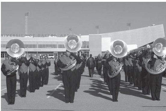
Members of the Stebbins Marching Band gear up before competition begins at Welcome Stadium.

It's been another phenomenal season for the Stebbins Marching Band. On Saturday, November 7 th , the band performed for the first time ever at the Mid States Band Association Championship where the band went toe-to-toe with some of the best bands from Kentucky,